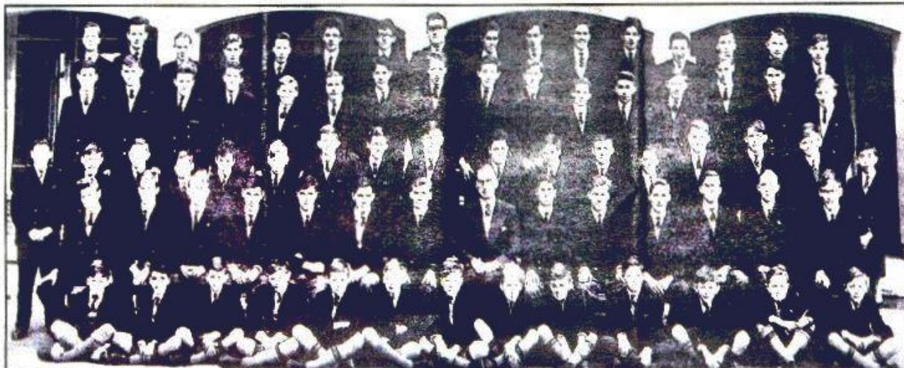
Old school: The class of 1967 line up to be captured for posterity